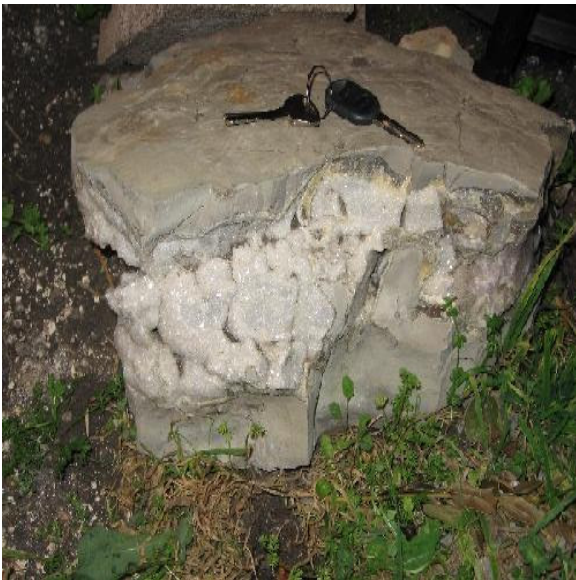
Calcite Concretion found by Ling Shurtz at Midlothian, TX.

Calcite can be found as crystals or in massive form. The crystals are generally hexagonal (six sided) in shape but also form rhomboids (solid parallelograms). The color is generally clear or white but also can be yellow, green, pink, red, blue, or black plus a few more colors tossed in for good measure. Calcite exhibits birefringence, or double refraction – that is to say that if you place a piece of clear calcite with parallel faces over printed matter, you will see two images of the printing. Some calcite also displays phosphorescence if illuminated with ultra-violet light (a black light).