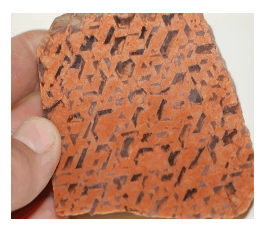
Graphic Granite from Burnet, TX

Now, let's move on to the Graphic part of the question. Graphic has many meanings. It can mean a clear or vivid picture (e.g. a graphic description of an earthquake). It can mean explicit (e.g. graphic violence). It can be a part of a computer that makes pictures or symbols on our displays (e.g. a graphic card). In mathematics, it can mean finding a solution by reading a value on a chart or graph rather than by performing a calculation. Finally, in geology, it means "having a texture formed by the intergrowth of certain minerals so as to resemble written characters". So Graphic Granite would be granite that has a surface resembling written characters.