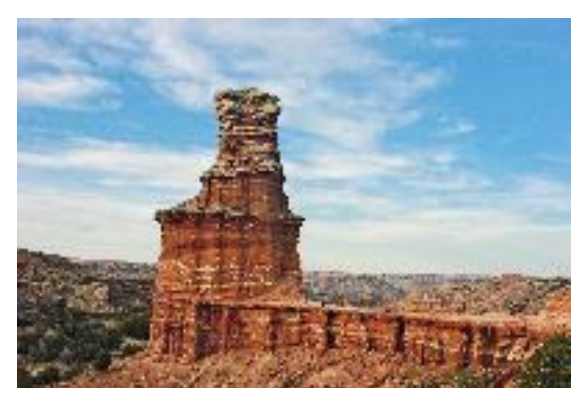
Lighthouse Rock, Palo Duro Canyon

The deepest canyon on earth is the Cotahuasi Canyon in southern Peru. Its depth is just over 11,000 ft (a little over 2 miles). What is the deepest canyon in the United States? Most would answer that question as "The Grand Canyon", but they would be incorrect. The deepest canyon in the United States is Hell's Canyon. It is located on the boarder of Idaho and Oregon and is about 8,000 ft (a little over a mile and a half) deep. The Grand Canyon averages about 4,000 ft deep and is about 6,000 ft (just over a mile) at the deepest point. Despite not being the deepest canyon in