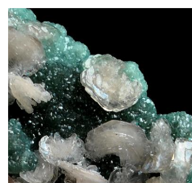
Calcite and Willemite specimen from Namibia viewed with normal light

The Calcite is white when viewed in natural or incandescent lighting, but orange to red