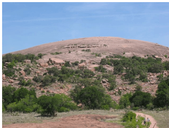
Enchanted Rock A small geological lift in the Llano Uplift

Massive quantities of granite and marble are quarried in the Llano Uplift area. If you have ever driven from Fredericksburg to Enchanted Rock state park you have undoubtedly seen some of the active quarries. The granite materials are also infused with dikes of pegmatite, and it is from some of the pegmatite that the Mason county blue topaz material (the state gemstone of Texas) is found. The graphic granite that I recently wrote a Question of the Month about is also found in the pegmatite found in the Llano uplift.