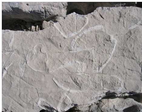
Limestone with Fossils from Austria

Limestone, with all its fossils, is the predominate rock form in the Dallas area. It is estimated that limestone forms about 10 % of the sedimentary rock in the world. With so much limestone, there must be something practical that can be done or made from it. How about cement? The TXI plant in Midlothian is just one of the many cement plants in the Dallas area. How about the calcium added to bakery products? That would be limestone. How about in toothpaste as a polishing agent and general filler? That, too, would be limestone. Limestone is used for buildings. The ground up limestone forms the base for buildings. Slabs of limestone are used as building blocks or as exterior veneers. Another practical use for limestone, or more properly, its absence, is to form caves. Some of the most extraordinary caves in the world are limestone. Acidic water dissolves the limestone forming the caves. A spectacular example is Carlsbad Caverns in New Mexico. For more