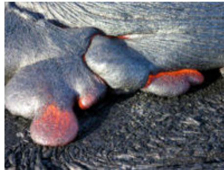
PAHOEHOE Lava Flow, Kilauea, Hawaii

To a rockhound, what are we looking for when we think of lava? Obsidian is the first think that comes to my mind. Obsidian is a volcanic glass. It forms when the lava flow cools rapidly which prevents crystallization. Obsidian is generally associated with a rhyolitic or dacitic lava flow, both of which are rich in silica, aluminum, potassium, sodium, and calcium.