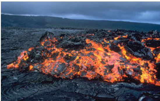
'A'A Lava Flow, Kilauea, Hawaii

The two most common types of basalt lavas have Hawaiian names, pahoehoe and 'a'a. Pahoehoe is a smooth, glassy basalt flow while 'a'a is a rough, spiny looking basalt flow. Other flows tend to be named for their chemical composition such as andesite flow, dacite flow, and rhyolite flow. Pillow lava, which most of us have heard about, is not a type of flow, but more descriptive of how it looks when it is cooled. Pillow lava forms under water or ice. The cool water causes the lava to form a thin skin. Then a hot area under the skin breaks through and starts to form a flow that covers a relatively small area and thickness before it also form a thin skin. The result is a flow that looks like a bunch of pillows stacked on top of each other.