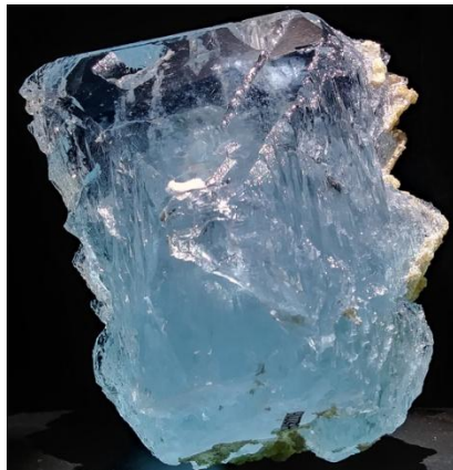
Aquamarine