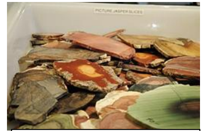
Jasper slices

Polish and Roman cultures recognize Bloodstone as the March Birthstone. Tibetan cultures recognize Jade as the March Birthstone. The Chinese culture does not have birthstones for the month but for the year. 2025 is the Year of the Snake. The birthstone associated with the Year of the Snake is Aquamarine.