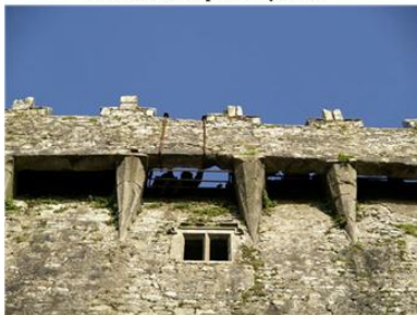
Note the iron straps around the Blarney Stone

Blarney Stone was a dangerous undertaking. Today, iron rails have been attached to the Blarney Stone to hold on to, and an iron grating has been added to connect the base of the parapet to the battlements – it will prevent a person from dropping head-first to the ground. I imagine there is still a risk of a headache if you slip and fall head-first into the iron grating. If the Blarney Stone is in Ireland, how could there be a connection to Texas? In 1939, Texas Tech (Lubbock, TX) unveiled a monument with a piece of the Blarney Stone atop the memorial. According to a PDF article from the Southwest Collections / Special Collections Library at Texas Tech, a group of petroleum engineers found the piece of the Blarney Stone on March 7, 1939, on a field trip to Ireland. After carefully examining the stone, they found it matched a piece of the Blarney Stone that had disappeared from Blarney Castle in 1659.