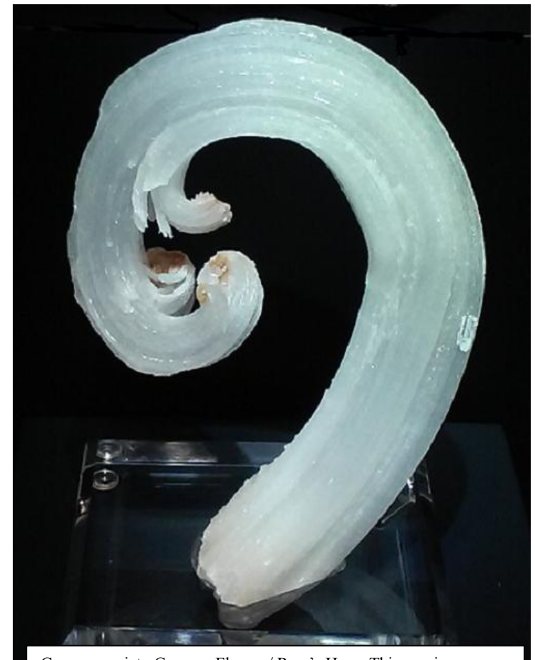
Gypsum variety Gypsum Flower / Ram's Horn. This specimen was found near Terlingua, Brewster County, Texas and is on display at the Perot Museum of Nature and Science, Dallas, TX

Visit us: www.pogmc.org "Like" us on Facebook