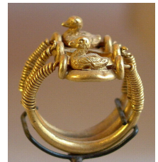
Egyptian Gold Ring

The purity of gold is measured in carats, abbreviated a "k" with 24k gold being 100 % pure. However, because gold is so soft and rather expensive, gold is often mixed with other metals to form alloys. 18k gold is 75 % pure gold and 25 % other metals. 18k gold formed with 75 % gold and 25 % copper is found in some of the older jewelry from Russia and is called "rose-gold" due to its reddish color. 18k white gold is formed with 75 % gold, 17.3 % nickel, 5.5 % zinc, and 2.2 % copper. Although I have never seen it, blue gold is formed by alloying with iron and purple gold is formed by alloying with aluminum. 18k, 14k, 12k and even 10k gold is frequently used in jewelry making. The silver, copper, and other metals that are alloyed with the gold result in materials that are still corrosion resistant and are stronger than pure gold.