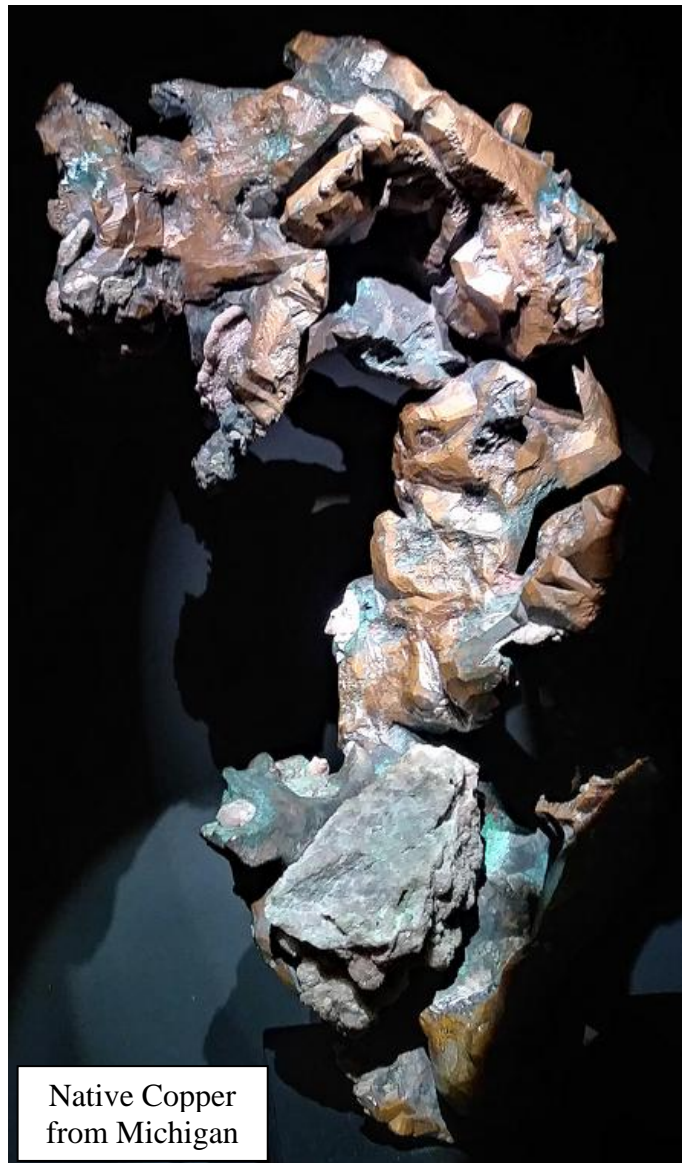
Native Copper from Michigan

Copper was good for many uses, but at a Mohs hardness of 3.0 it was too soft for such things as arrowheads, knives, axes, and other hunting and war implements (spears, etc.). Some of the copper that was smelted was a bit harder and stronger than other batches – hard enough for use in making knives, war; these were contaminated with zinc and tin. It was