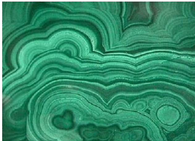
Malachite from Zaire

Malachite is relatively soft rating a 3.5 to 4 on Mohs hardness scale. Still, malachite is often formed into broaches, pendants, and other pieces of jewelry. Botryoidal forms of malachite ore often just tumbled and displayed as specimens, the wavy lines of light and dark material forming interesting patterns as they warp around the curved surface. Because it is relatively soft, malachite can also be easily carved. Some of the most impressive pieces of art made from malachite can be found at the Hermitage Museum, St. Petersburg, Russia which was founded in 1764 by Catherine the Great. A large malachite vase (Malachite Coupe) and the Malachite Room are part of the collection. A virtual tour of the malachite room (and others) can be found on the Internet at and would be well worth the time spent. The columns in the room appear to be solid malachite, but in fact are a malachite veneer fabricated from smaller pieces that are perfectly fitted.